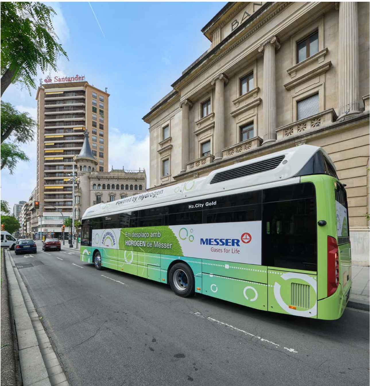
Test drive of a fuel cell-powered bus in Tarragona, Spain.

The biggest advantage of fuel cell electric buses (FCEBs) is certainly that they emit no climate-damaging emissions, unlike conventional buses equipped with diesel engines. This is good for the environment, good for the people in the inner cities, and may soon be a „must“ as more and more cities decide to become completely emission-free.