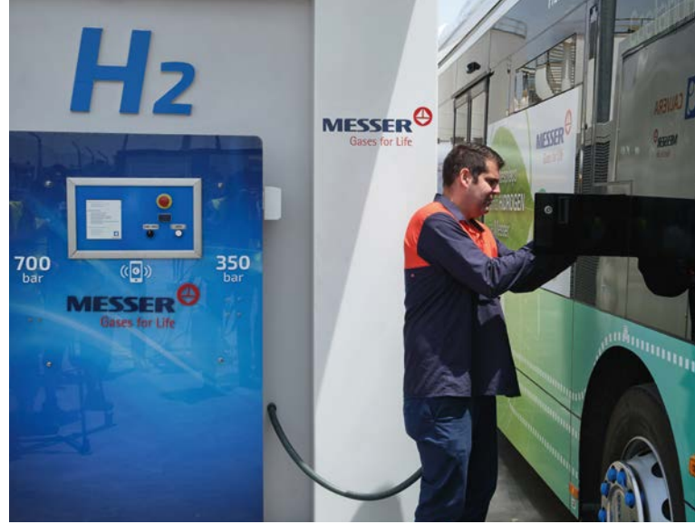
Messer has many years of experience in supplying bus fleets with hydrogen.

For sustainable mobility, Messer is working with the Toyota Group to offer a comprehensive solution for hydrogen-powered buses - including hydro generators and all the services required for operation: the „One-Stop-Shop“. As part of the „One-Stop-Shop“, you receive vehicles, financing, hydrogen and technical service from a single source. Payment is made per kilometer driven or per kilogram of hydrogen consumed. This gives you the